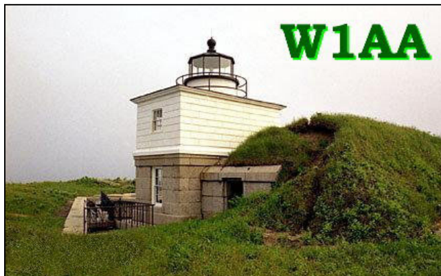
CLARK'S COVE LIGHTHOUSE 2007