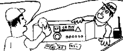
SAM THE HAM