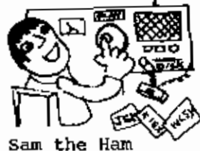
Sam the Ham

Wow that CD rig is nice New Zealand with no power no antenna no static