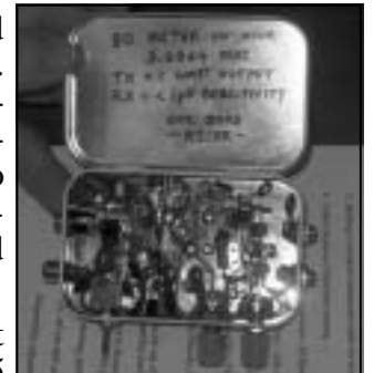
K1IBR'S 80-M CW XCVR & BALUN

Bill also showed us a 40-meter QRP ensemble that consisted of a transceiver, that tunes to 7.125 MHz, an antenna tuner and a reflected power meter that is used to obtain the best match. Bill replaced the original FET finals with transistors because he thought 17 W was too much for a QRP rig!