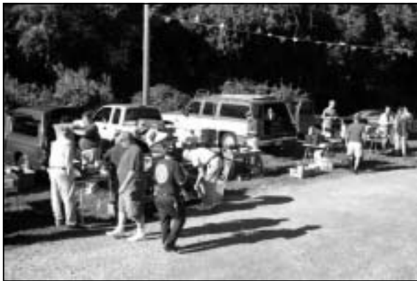
ACTIVITY ON THE SEMARA MIDWAY