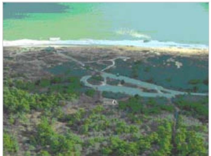
MARCONI STATION SITE, DECEMBER 4, 2004

T he National Park Service allowed visitors to enter the station and participate in the event by observing operators having a spark gap model demonstration. Youngsters of all ages tapped out their names in Morse Code on practice keyers. Over 276 visitors joined us at the Coast Guard Station and over 250 people visited the historic Marconi Site in South Wellfleet with Cape Cod National Seashore