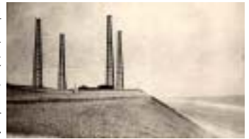
ORIGINAL 4 TOWERS

and the USA. A formal message was received from the Marconi Point Reyes Station, K6KPH - Point Reyes National Seashore, Cape Cod National Seashore's sister station in California.