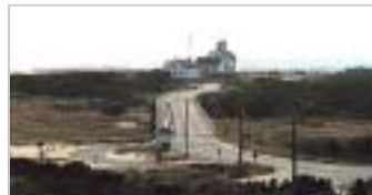
MARCONI SITE 1 MILE DISTANCE

Contacts included Sao Tome (an Island off of Africa), Benin, Kuwait, New Zealand, Australia, Japan, European and Asiatic Russia. A number of contacts were made with other International Marconi Day Stations in Ireland, Great Britain, Canada,