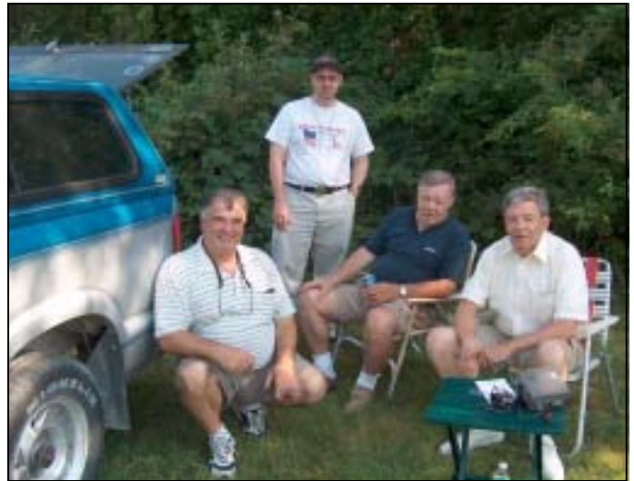
QRP STATION SET UP FOR TECH TALK

B uilding techniques and specialized tools were on display. We learned that the advantages of getting a high-end solder station are that the handle stays cool, the tip temperature is controlled, and they have assorted tips for the various soldering tasks.