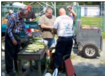
THE CREW PREPARING THE CORN