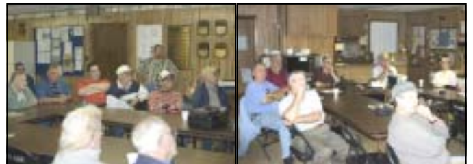
SOME OF THE TECH TALK ATTENDEES