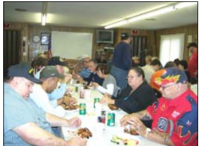
THE FEAST BEGINS ...

S EMARA enjoyed their first BBQ feast since the oil spill incident. Even the restricted parking caused by the heaps of bottle-filled soil (from the former Dartmouth dump that was on the site) didn't keep anyone away.