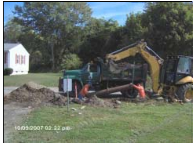
DRAIN INSTALLATION - STEP 2