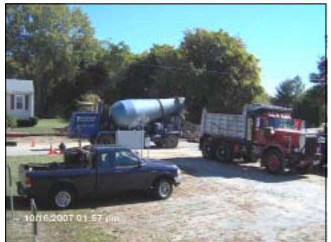
REMOVING THE BLACK TOP