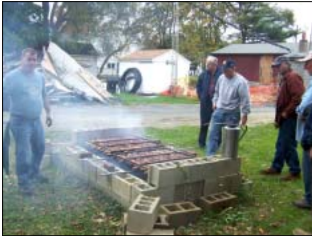
THE "CREW" DOING THE HONORS

S EMARA enjoyed their first BBQ feast since the oil spill incident. Even the restricted parking caused by the heaps of bottle-filled soil (from the former Dartmouth dump that was on the site) didn't keep anyone away.