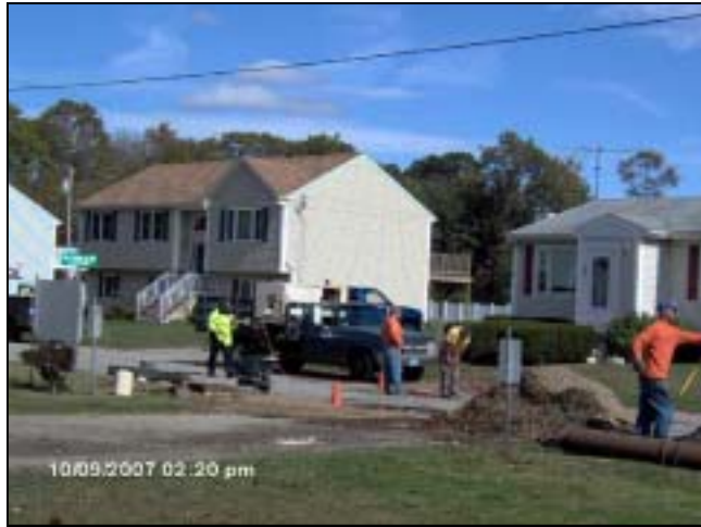
DRAIN INSTALLATION - STEP 1