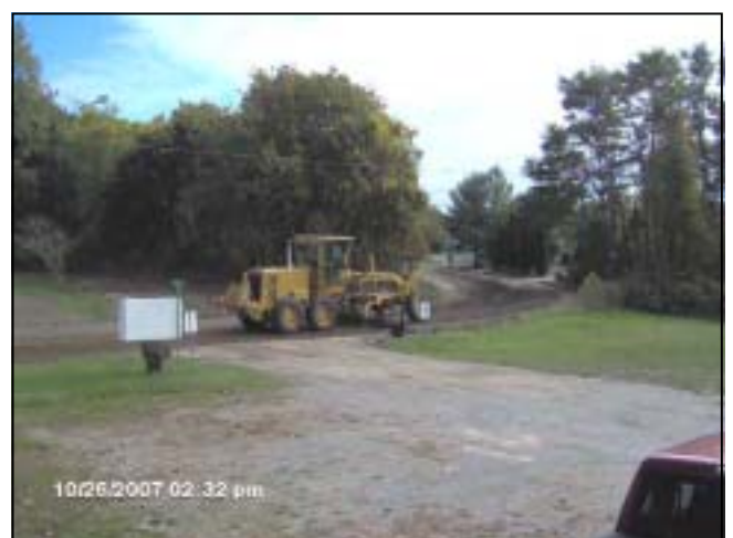
DONALD AND BLISS LEVELED DIRT