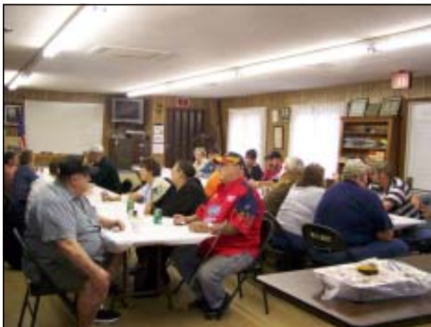
CONVERSATION BEFORE THE FEAST

A hush fell across the hall as everyone dug into the food. Each person was given a half chicken, fully covered with the 'secret' glaze that Scott, W1EV always uses. This was complemented by a sumptuous antipasto salad plus rice pudding and brownies.