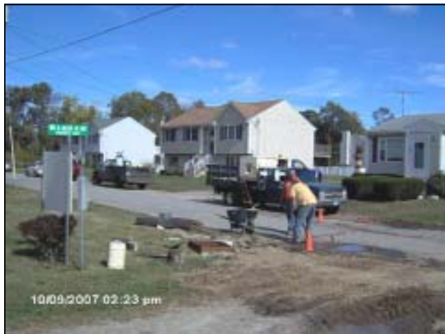
WILLIAM M. MILLER, JR. WAY