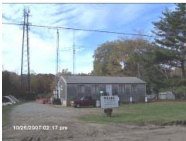
SEMARA'S ALL DIRT LOOK