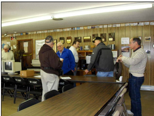
WHO ARE WE VOTING FOR?