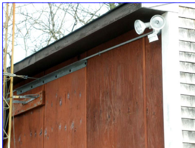
2. OUTSIDE LIGHT INSTALLATION BY MARCEL-W1MLD, DICK-K1AHA + DAVE-K1JGV ASSISTING