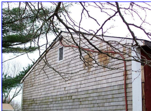
3. NEW RAKE BOARDS BY RAY-KB1EVX + DAVE-K1JGV