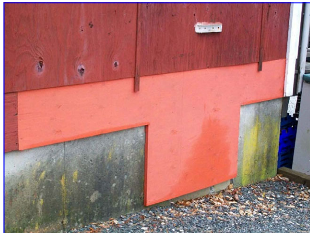
1. OLD HEATING DUCT HOLE COVER BY RICH-W2RG

.../scholarship_info/application_form.doc