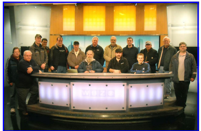
TOUR GROUP AT WBZ4 ANCHOR DESK

Help me out—who are the SEMARA members in the pictures?