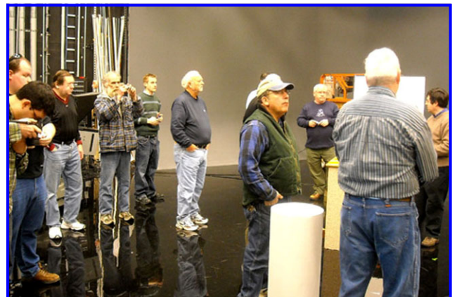
TOUR GROUP AT WGBH STUDIOS