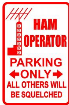
SEMARA PARKING SIGNS? FOUND ON THE INTERNET BY ARMAND-W1BUG