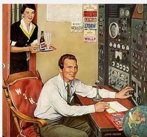
WAS THIS THE 'GOOD OLD DAYS'? THANKS TO ARMAND-W1BUG

(October Radio Activity continued from page 8)