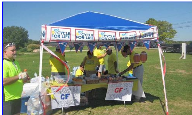
SIGN UP TENT

Carolyn's Sakonnet Vineyards, Little Compton, RI. September 27, 2014.