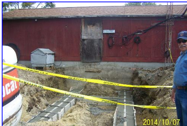
MARCEL-W1MLD "CLERK-OF-THE-WORKS" SURVEYS THE NEWLY POURED BASE FOUNDATION