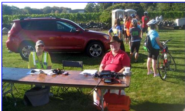
TWO OF THE SIX HAM OPS THREE EACH FROM NEWPORT & SEMARA