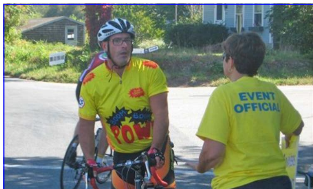
ON THE COURSE CHECKING WITH EVENT OFFICIAL